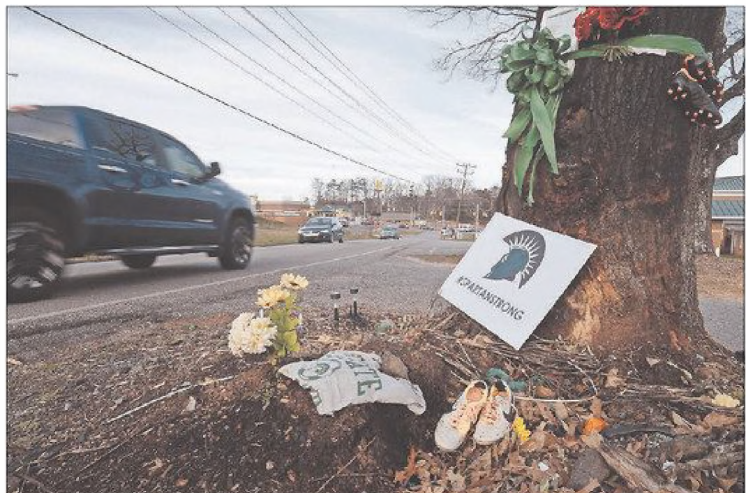
Memorials remain at a tree on Fourth Street in Boiling Springs where a car crash claimed the lives of four USC Upstate students in October.