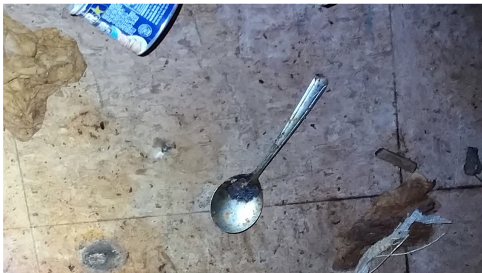
Spoon with residue in it.