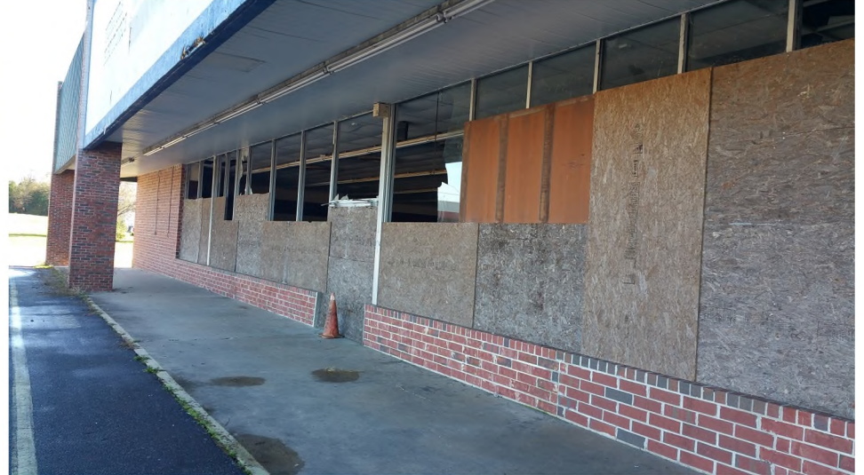
Front Façade far left. (Boarded up with broken glass)