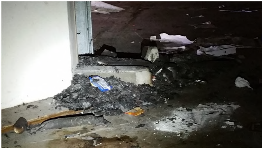
Evidence of past fires