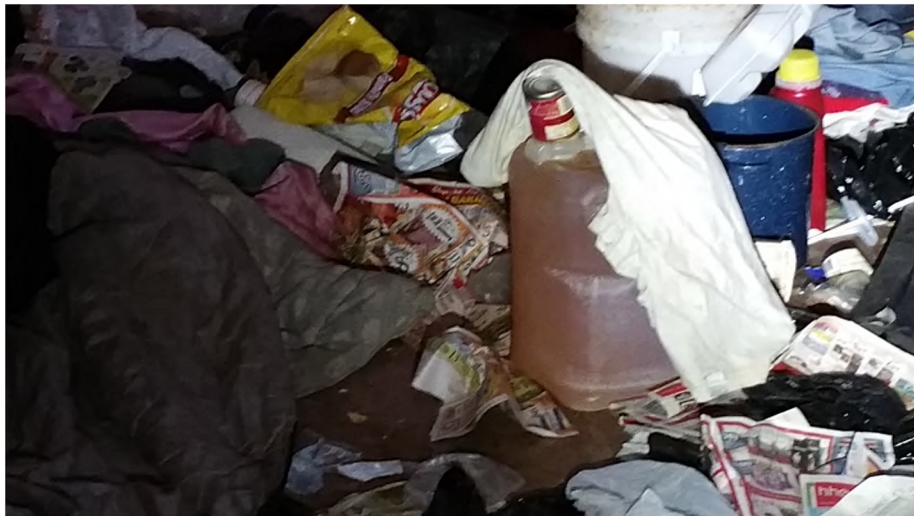
Debris including a five gallon jug of excrement