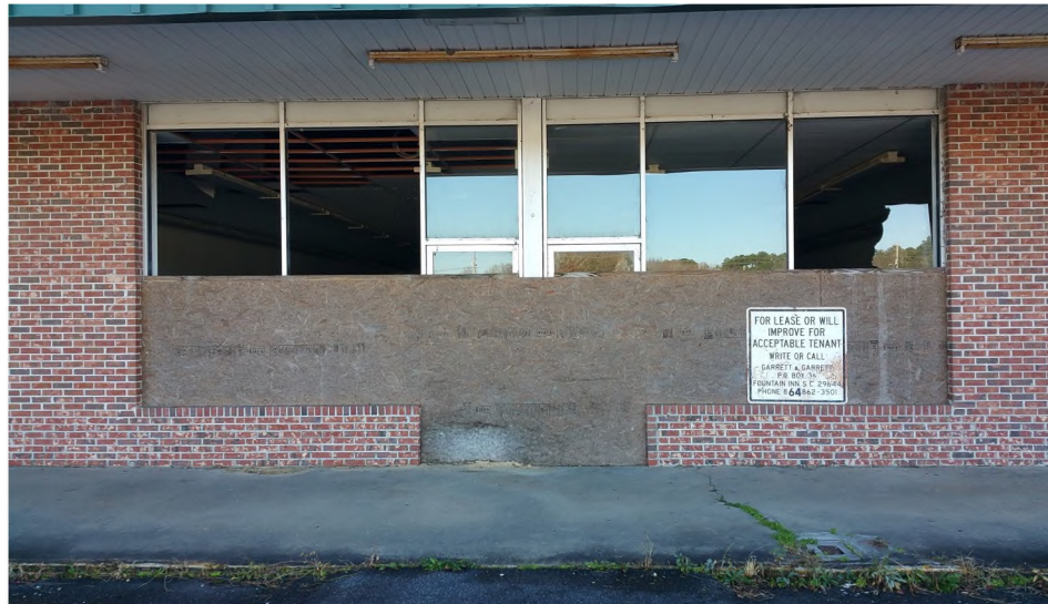
Front Façade—Center of Building Secondary Storefront