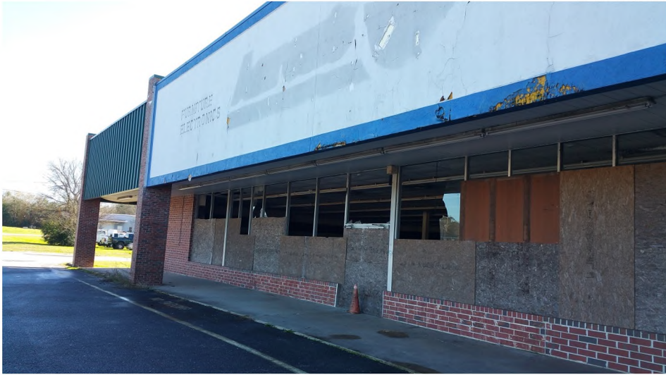
Front Façade from left, closest to Wylie Street