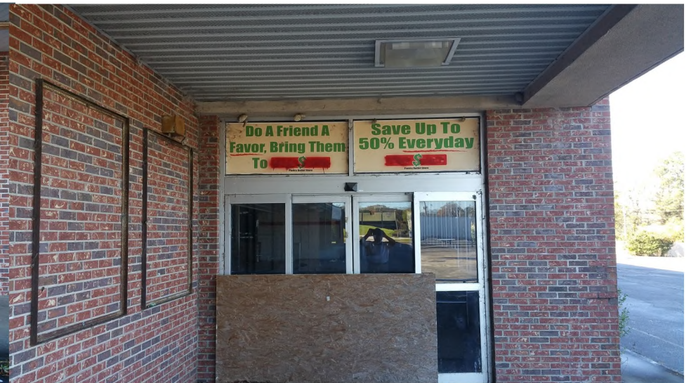
Front Façade—Automatic doors boarded