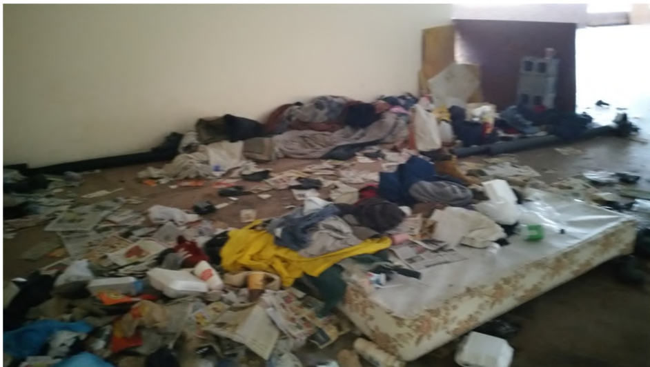
Debris of mattresses, sleeping bags, clothing, trash or other personal items, etc