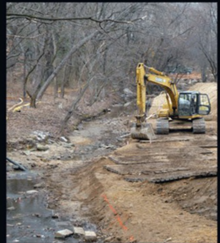
Watts Branch during restoration