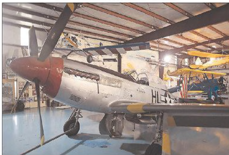
A P-51 Mustang on display at the Triple Tree Aerodrome museum in Woodruff.