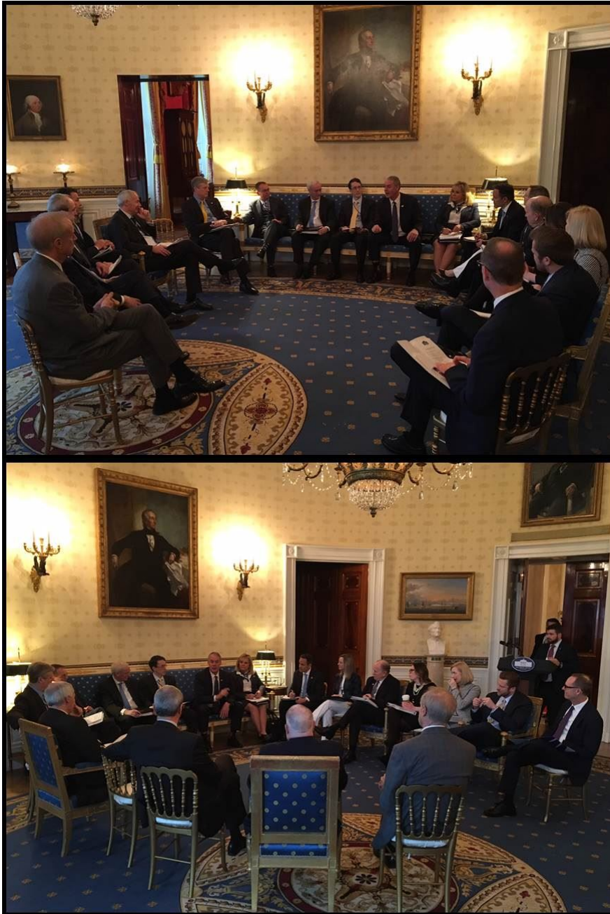
Our Nation's Governors at the White House Business Session participating in breakout sessions on infrastructure with federal officials - February 26, 2018