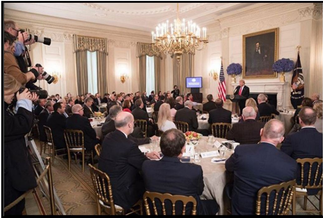
President Donald J. Trump at the 2018 White House Business Session with state governors - February 26, 2018

WHAT THEY ARE SAYING | Support Continues to Build for the President's Infrastructure Initiative The President's effort to rebuild America's infrastructure continues to gain support from the American public and commentators.