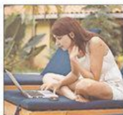
Tips for taking time off from digital devices Living on the Go, 1C