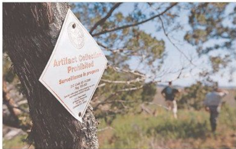
Fig Island, hidden amid the Lowcountry marsh landscape, is home to elaborate oyster shell rings created by prehistoric people.

Vandals, thieves make a mess of S.C.'s fragile historic, natural sites