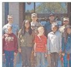
North Aiken's Young Men, Ladies visit Fort Gordon Local News, 2A