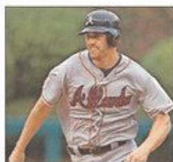
Philadelphia Phillies hand Atlanta Braves loss 8-2 Sports, 1B