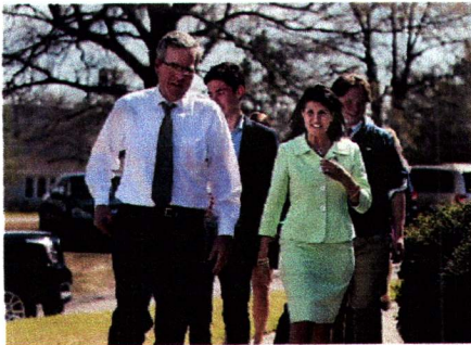
Enlarge Former Florida Gov. Jeb Bush and South Carolina Gov. Nikki Haley visited the headquarters of Sistercare, a safe shelter for battered women in the Columbia area, on Tuesday. Bush discussed his efforts against domestic violence when he was governor.

The comments came Tuesday afternoon at the headquarters of Sistercare, a Columbia-area battered women's shelter. Bush appeared with Gov. Nikki Haley after the two privately toured a safe house shelter for battered women.