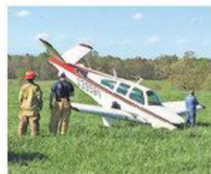
A small plane made an emergency landing in an Anderson County field on Monday.