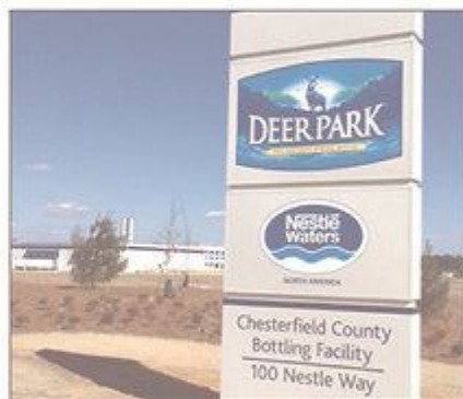
The Nestle Waters bottling plant, which is located one-half mile southeast of McBee on S.C. Highway 151, is celebrating its grand opening with a community open house from 11 a.m. until 3 p.m. Saturday, April 9, at 100 Nestlé Way off Highway 151. The event is open to the public.

jobs in the initial planning. According to Strowe, a little over half of these employees reside in Chesterfield and Darlington counties, while three-fourths of the employees live within a 60-mile radius of the plant. The annual payroll is nearly $2 million, with wages and a benefit package in the top quarter of the area work force within a 60-mile radius.