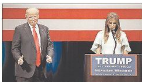
Republican presidential hopeful, Donald Trump, left, reacts to the words of his wife, Melania, as she addresses the crowd during a rally Monday at the Milwaukee Theatre in Milwaukee.

Those included re-tweeting an unflattering photo of Cruz's wife and a series of contradictory comments on abortion that managed to draw condemnation from both abortion rights activists and opponents.