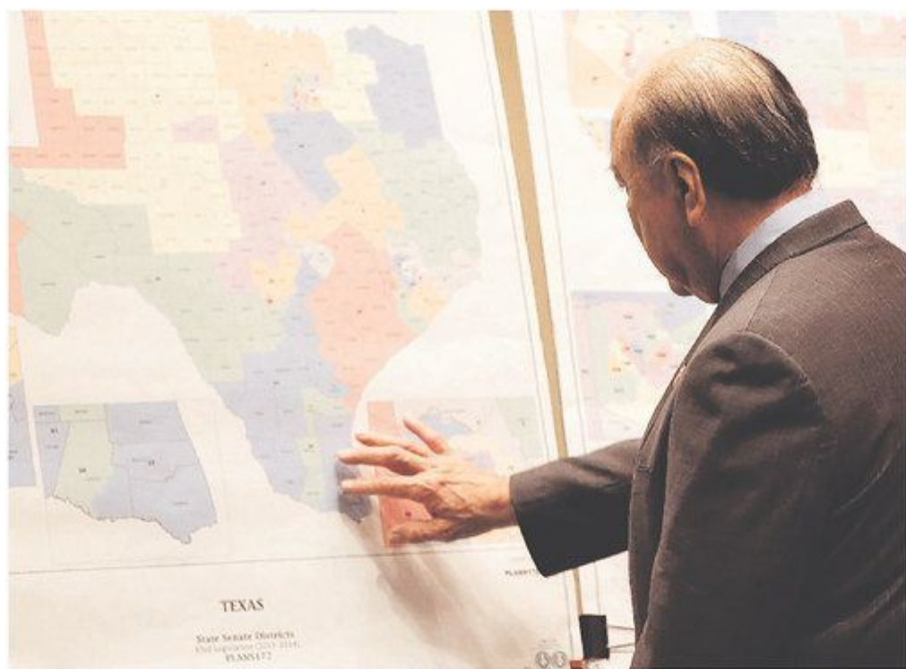
The U.S. Supreme Court upheld Texas's system of drawing voting districts based on everyone who lives there, not just registered voters.

Aaron Baddeley joins the field for the 48th annual RBC Heritage Presented by Boeing, which tees off Monday. 1B