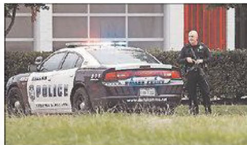
Dallas police tighten security at their headquarters after receiving an anonymous threat against law enforcement across the city Saturday in Dallas.