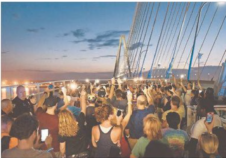
A large crowd gathered Sunday at the top of the Ravenel Bridge to observe a moment of silence following a unity rally held in response to the killings of, and by, police officers during the past week.

After a heartbreaking week for nation, 200 gather at a local church to pray and speak out, while others demonstrate love at unity walk