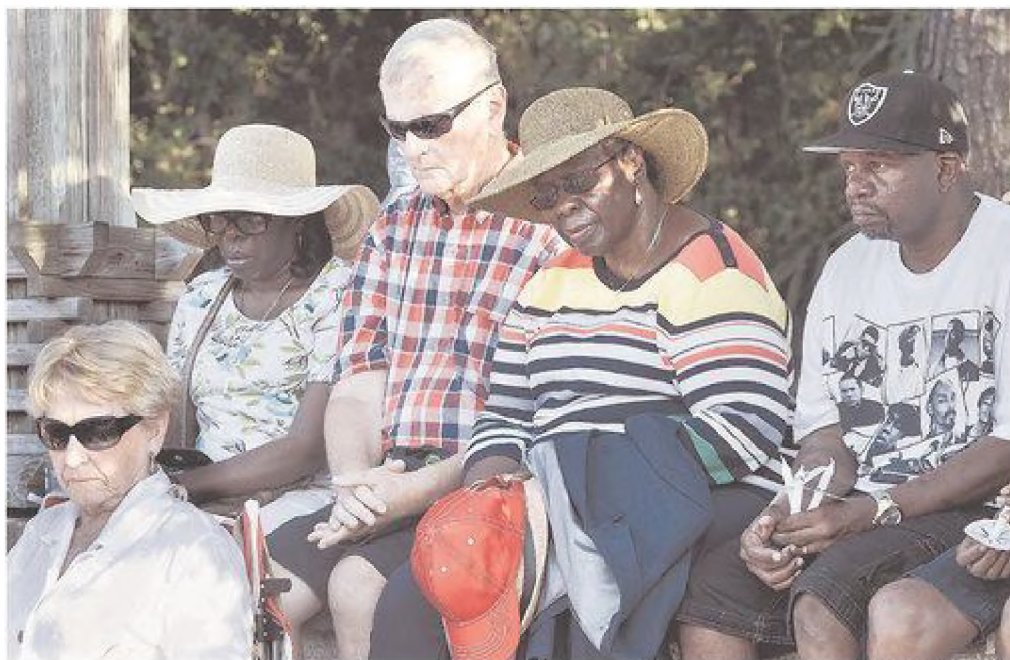
Members of the audience pray during Sunday night's Community Prayer Vigil honoring the victims of last week's violence in Baton Rouge, La., Minneapolis and Dallas. The service was held at Veterans Memorial Park in Shelter Cove.