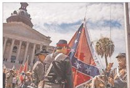
Supporters raise the Confederate battle flag Sunday during a rally organized by the U.S. Secessionist Party at the Statehouse in Columbia. The event marked the one-year anniversary of the Confederate flag's removal from Statehouse grounds.