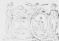
EXHIBIT I 1/20/77