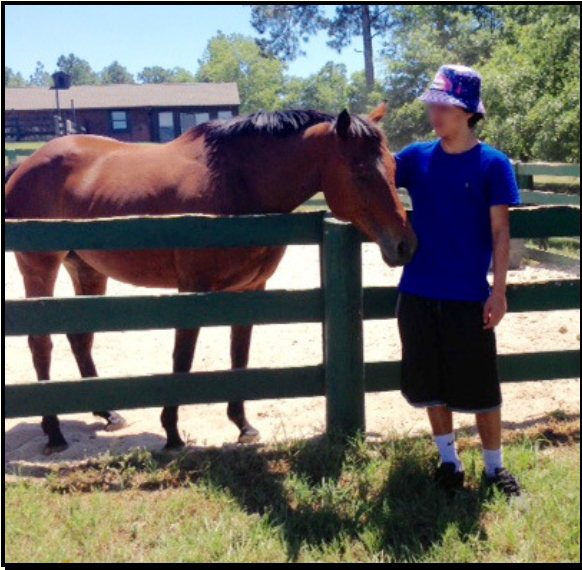
A DJJ juvenile helps with Equine Rescue

The Aiken Equine Rescue (AER) was founded in 2006 and resides on 90 acres of farmland in Aiken County. Their mission is to rescue unwanted horses suffering from abuse and neglect and to “repurpose” Off-The-Track thoroughbreds. Each horse is provided food, shelter, medical attention and personal interaction until an appropriate home can be found.