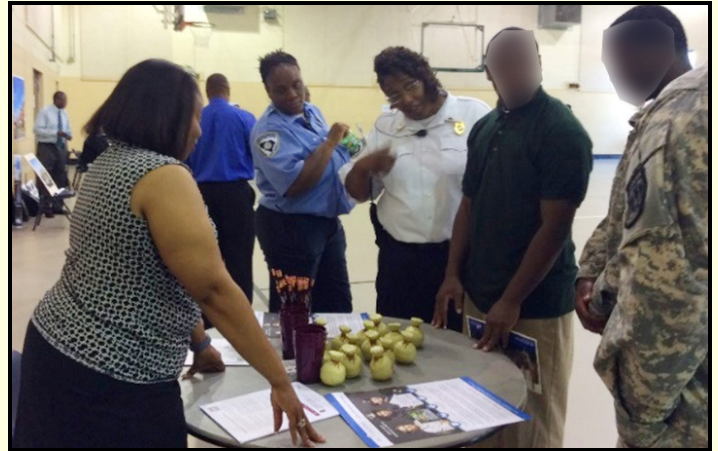
Students, employees and teachers participate in the Career Fair