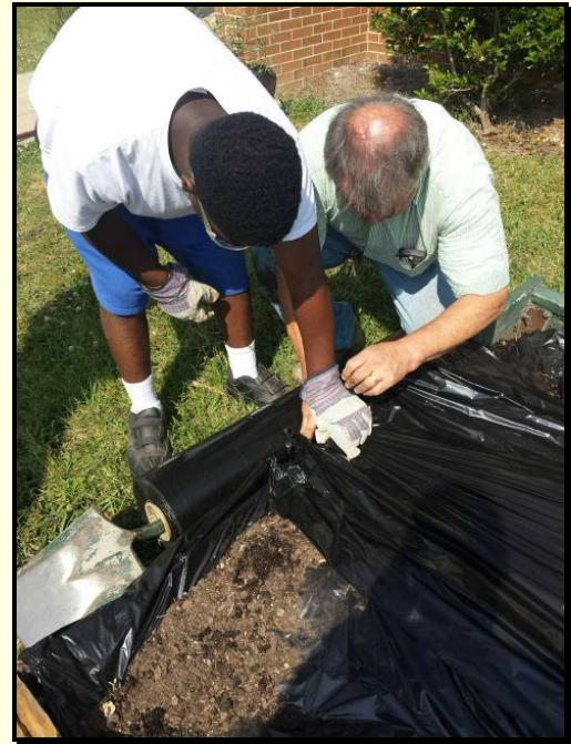
Staff, volunteers and youths participate in Super Service Saturdays

Have time you want to volunteer, and just don't know what to do? DJJ is sponsoring Super Service Saturday. What is "Super Service Saturday?"