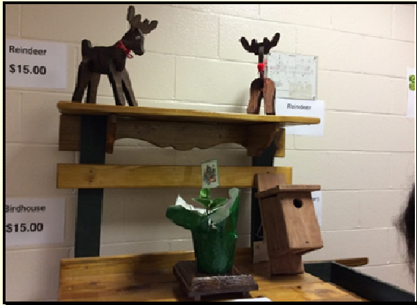
Student-produced items on display at the Spring Fling

On April 13th, the DJJ Career and Technology Education (CATE) Team sponsored the annual Spring Fling activity. Birchwood School faculty and staff had the pleasure of purchasing items such as fish dinners from the Culinary Art Department, recipe books and artwork posters from the Integrated Business Applications Department, beautiful flowers and plants from the Horticulture Department. They also placed orders for birdhouses from the Carpentry Department, welded palmetto trees from the Welding Department, purchased select framed quotes from the Visual Arts Framing class and much more.