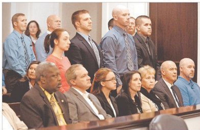
Supporters of former North Charleston police officer Michael Slager, including several former co-workers, stand at his attorney's request Monday afternoon during a bond hearing in front of Judge Clifton Newman.

Do officers demonstrate brotherhood or send the wrong message?