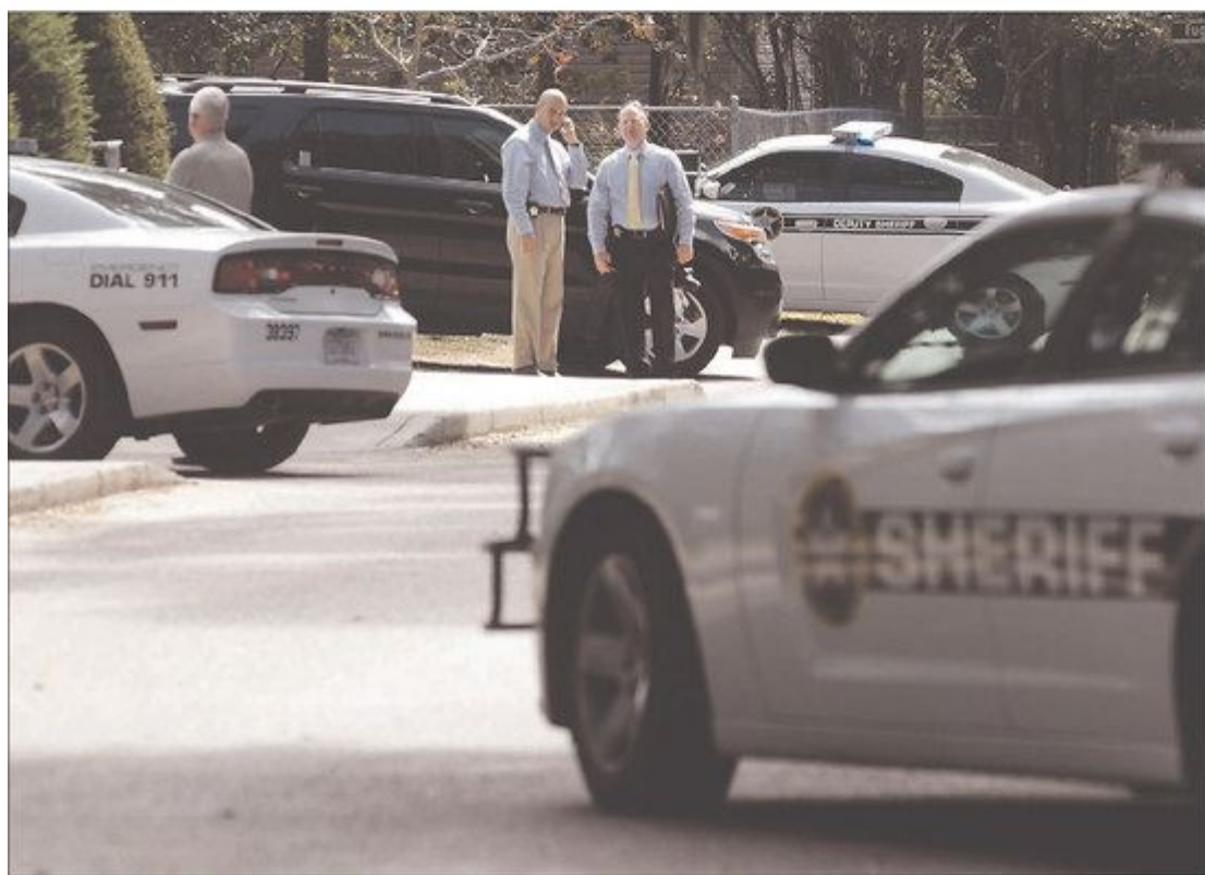
File • Staff photo

The year was the deadliest in Beaufort County in at least the past 20 years