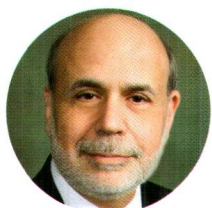
Ben S. Bernanke Chairman, The Federal Reserve System (2006-2014)