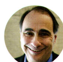
David Axelrod Senior Strategist, 2012 Obama Re-election Campaign; Senior Advisor to President Barack Obama (2009-2011)

For more information and to register, visit www.PublicFundsForum.com or call (310) 476-8108.