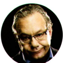
Lewis Black Comedian, Actor and Author