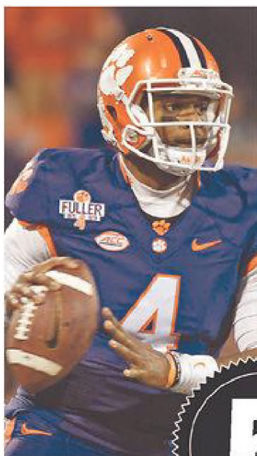
NO. 1 CLEMSON