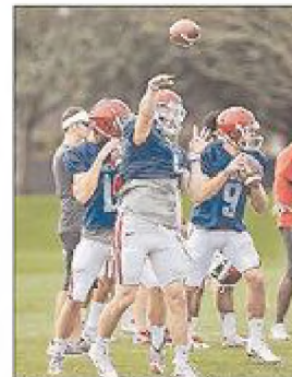
Oklahoma quarterback Baker Mayfield throws during practice Sunday.