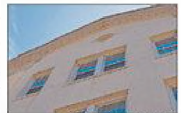
No. 5 - During its Oct. 26 meeting, Aiken City Council approved a building height ordinance increase from 50 feet to 55 feet.