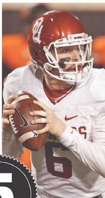
NO. 4 OKLAHOMA