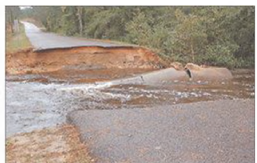
No. 2 - An overflowing McFlier Creek washed away this part of Cumbee Trail Road in the Ridge Spring-Monetta area after heavy rains in October.

Then something horrible happened. At the historic Emanuel AME Church in Charleston, in June, three gunmen Dylan Roof shot and killed nine people in a church during a Bible study, including Rev. Clements Moore.