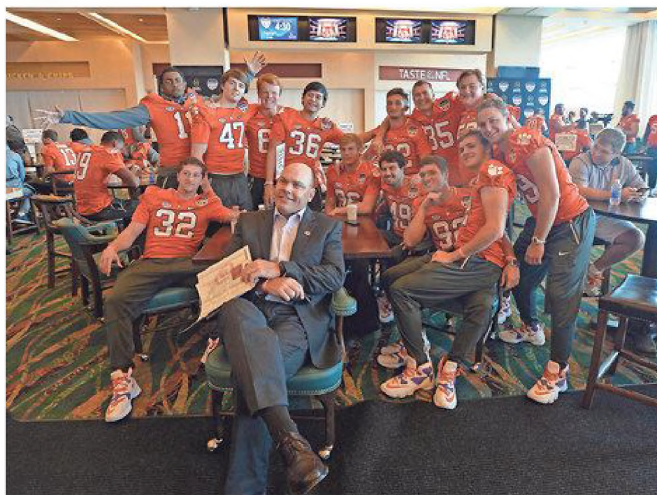
Clemson will play Oklahoma in the Orange Bowl, at Sun Life Stadium in Miami Gardens, Fla., at 4 p.m. on ESPN.