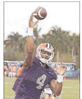
Clemson quarterback Deshaun Watson throws during practice Monday.

to starter at two different schools, sitting out last season at Oklahoma after transferring from Texas Tech. It's a nearly unheard of feat, especially when you consider Mayfield's performance this season.