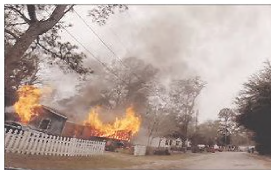
Burton Fire Department