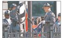
No. 4 - An honor guard from the South Carolina Highway Patrol lowers the Confederate battle flag as it is removed from the Capitol grounds in Columbia on July 10.