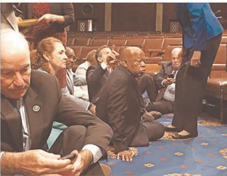
Democrats in Congress, including Rep. John Lewis, D-Ga. (center), participate in a sit-in protest Wednesday to seek votes on gun-control measures on the floor of the House in Washington. They were prepared to stay the night.

Protesters pushing for votes camp out in House, taunt Republicans