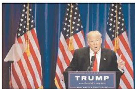
Republican presidential candidate Donald Trump speaks at the Trump Soho Hotel on Wednesday in New York.