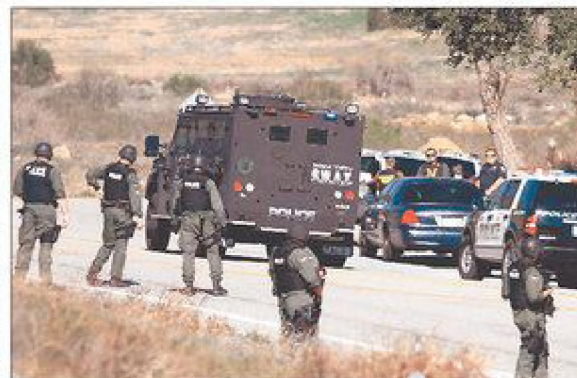
Law enforcement officers man a roadblock on Highway 38 in Mentone, Calif., and leading to Angeles Oaks, where a shootout with fugitive Christopher Dorner was in progress on Tuesday.