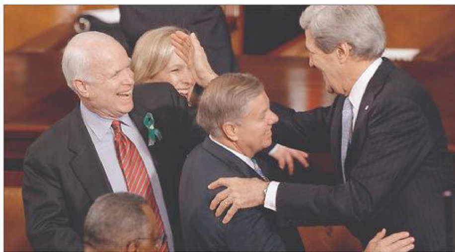
Secretary of State John Kerry, right, greets Sen. Lindsey Graham, R-S.C., center, and Sen. John McCain, R-Ariz., before President Barack Obama's State of the Union address Tuesday.