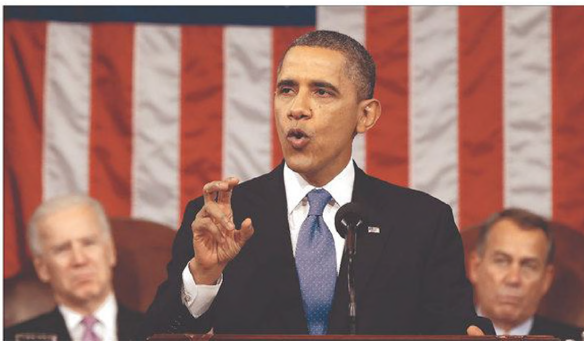
President Barack Obama, flanked by Vice President Joe Biden and House Speaker John Boehner of Ohio, gestures as he gives his State of the Union address during a joint session of Congress on Capitol Hill in Washington on Tuesday evening.