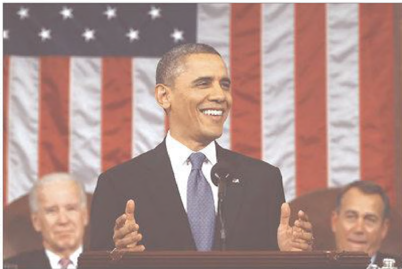
President Barack Obama, flanked by Vice President John Biden and House Speaker John Boehner, smiles as he gives his State of the Union address during a joint session of Congress on Capitol Hill in Washington on Tuesday evening.

In specific proposals for shoring up the economy in his second term, an asser-