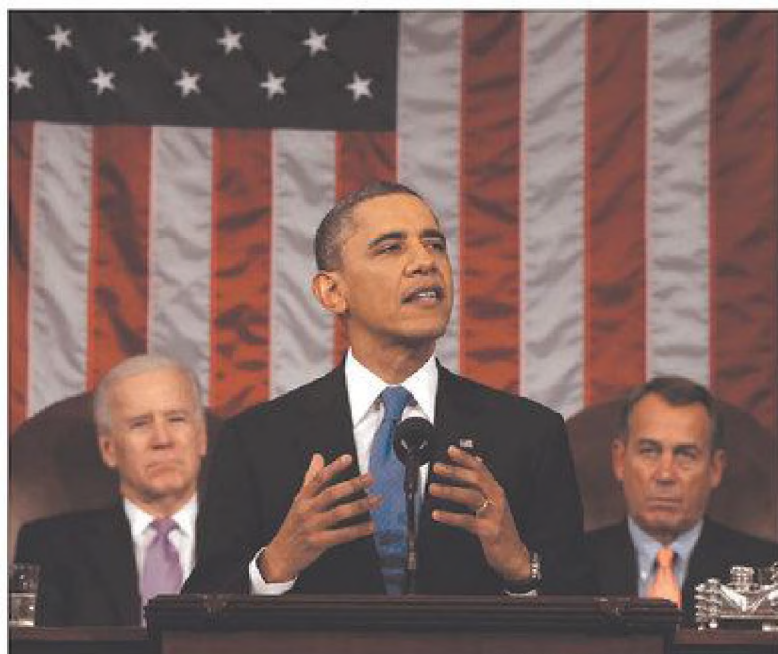
President Barack Obama, flanked by Vice President Joe Biden and House Speaker John Boehner of Ohio, gives the State of the Union address Tuesday in Washington.