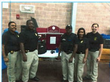
Several Agents from the Richland County Office participated in Columbia's National Night Out kick off at the Drew Wellness Center on July 28th (left) and the Community Social Event on Columbia's Main Street on August 1st.