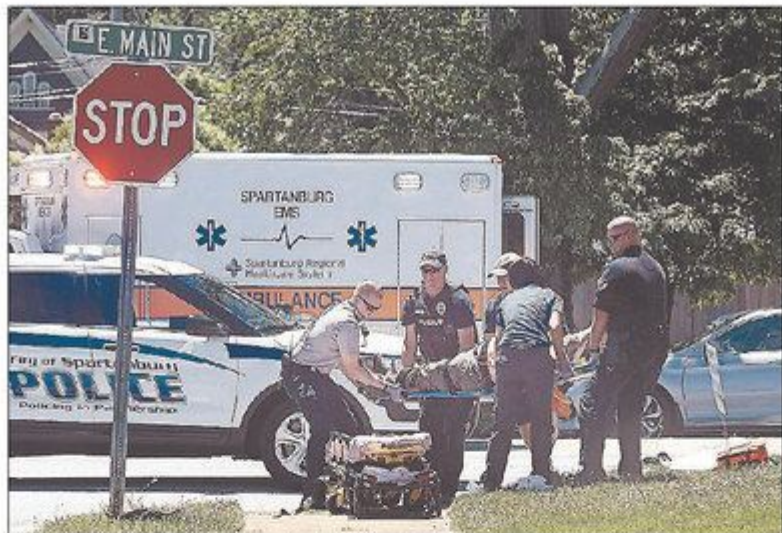
Police said a case of road rage near downtown Spartanburg led to a man being shot in the middle of East Main Street on Wednesday afternoon. The person who was shot has been hospitalized.

Pacolet man arrested, charged with attempted murder