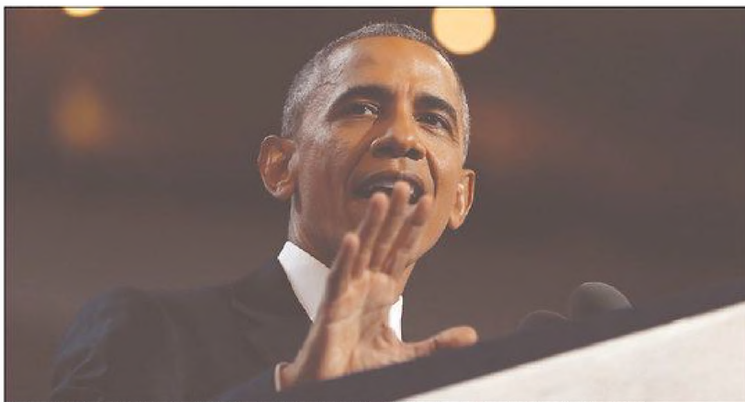
President Barack Obama speaks at the Democratic National Convention Wednesday in Philadelphia.