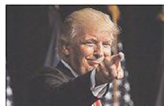
Republican presidential candidate Donald Trump points to the crowd after speaking during a campaign rally Wednesday at Lackawanna College in Scranton, Pa.

Wednesday night's Democratic lineup was aimed at emphasizing Clinton's own national security credentials. It was a