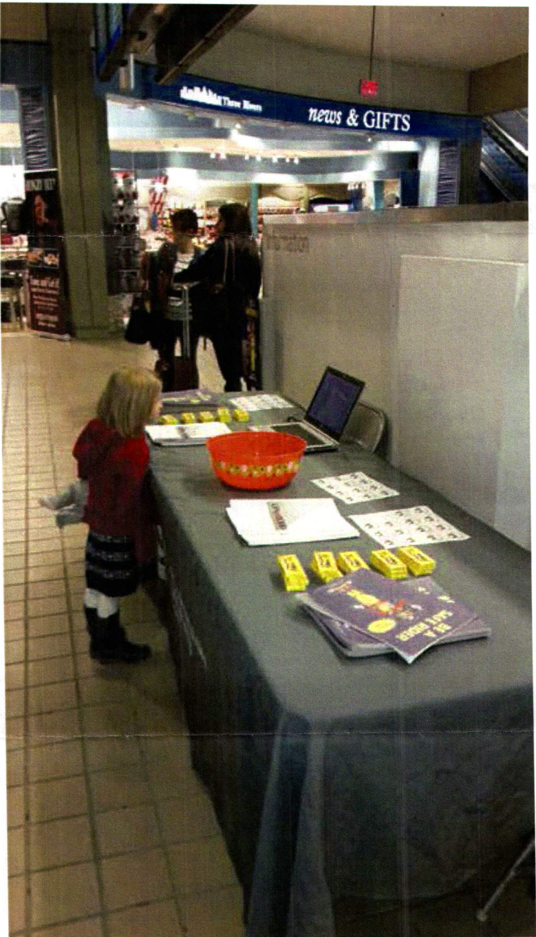
A young traveler watches a video produced by EESF on how to safely ride elevators, escalators and moving walks.

One city to observe Safety Week was Pittsburgh. Pittsburgh International Airport (PIA) has 31 escalators, 21 moving walks and 13 elevators in its terminals. James Gill, acting