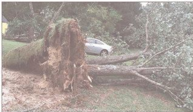
Severe thunderstorms tore through Chesterfield County last Friday, toppling trees and knocking out power in many places around the county.

Duke Energy Progress had reports of 3,600 customers without power all over the county due to downed trees and lines, as well as snapped poles.