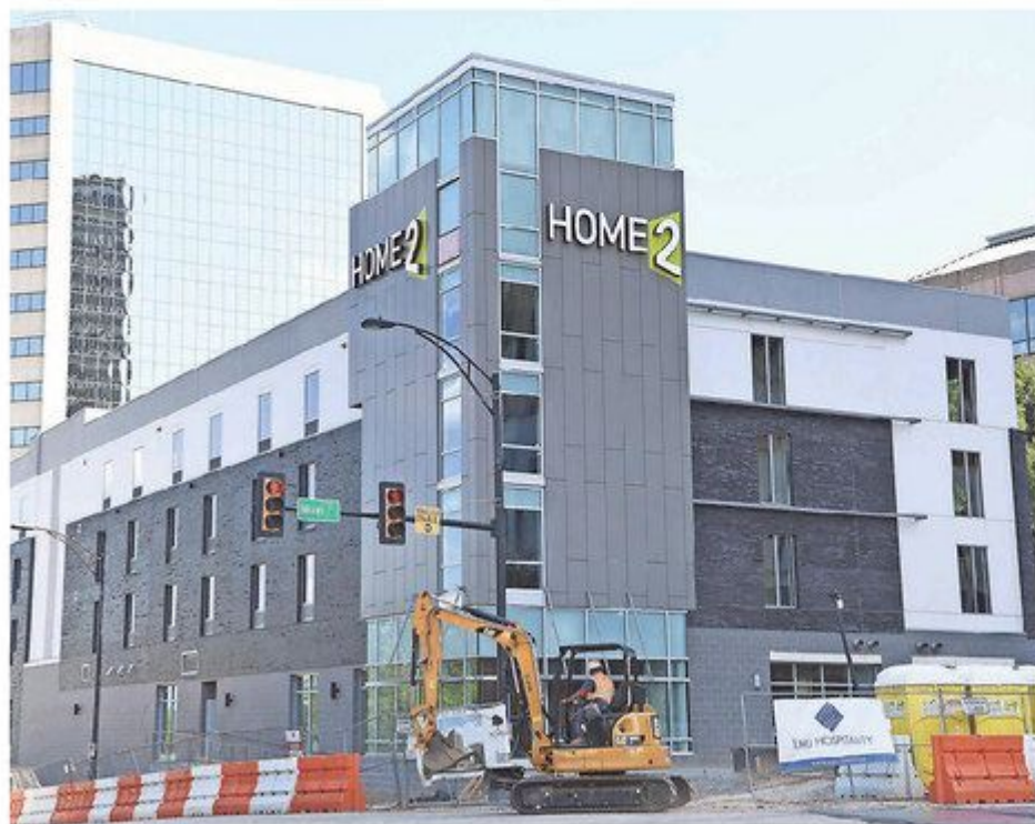
Construction continues on the new Home 2 hotel on North Main Street downtown.

SANDERS VOWS HIS FULL SUPPORT TO BACK CLINTON'S ELECTION PAGE 1B