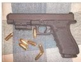
A photo on an alleged manifesto website created by Dylann Roof shows the .45-caliber Glock pistol he's accused of using in a deadly June 17 attack at Emanuel AME Church.