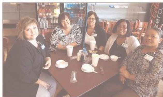
McLeod Health Cheraw celebrates a successful first year.