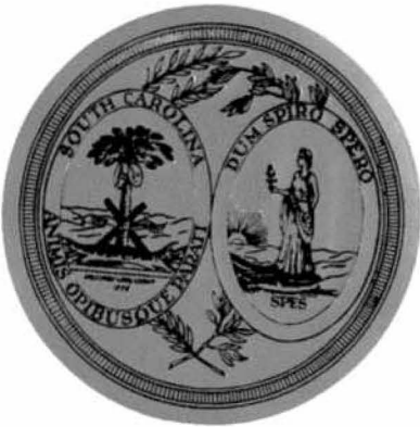
MARK SANFORD Governor

GIVEN UNDER MY HAND AND THE GREAT SEAL OF THE STATE OF SOUTH CAROLINA, THIS 23rd DAY OF OCTOBER 2009.