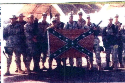
11th Tennessee in Vietnam