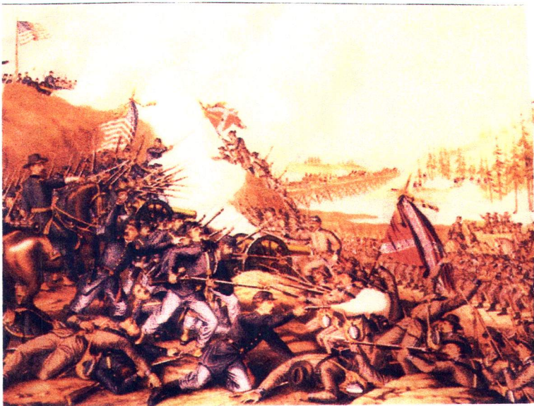
Battle for Franklin, November 30, 1864