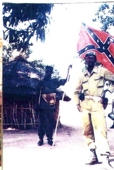
African Freedom Fighters