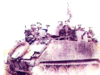
Troop Transport in Vietnam