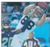
Florida's concerned about problems finishing games.