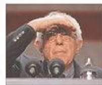
Sen. Bernie Sanders, I-Vt., speaks Tuesday at a town hall at Orpheum Theatre in Sioux City, Iowa.

Senator on the campaign trail before the painful enthusiasm that accompanied his unexpected rise in the Democratic race for president.