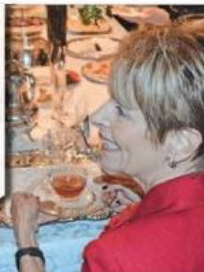
Local Citizens Heart Board members gathered for tea for survivors who say they support Wednesday at the 2016 Heart Board Tea at the Aiken Museum.