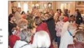
More than 200 survivors, and a few more, gathered Wednesday at the Aiken Museum Heart Board Tea event.