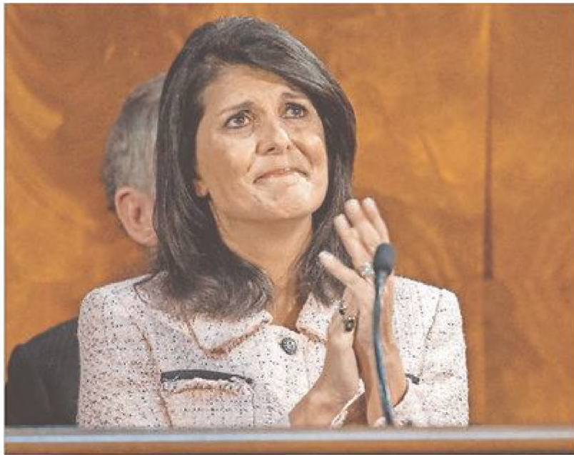
Gov. Nikki Haley holds back tears at the Statehouse in Columbia on Wednesday while delivering the State of the State address. Haley asked legislators to be inspired by victims and survivors of last year's tragedies to make South Carolina stronger.

With Emanuel survivors in audience, tearful Haley calls for unity while promoting domestic violence reform, education, roads agenda