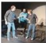
USC Aiken students to show are acting 'slinging' on the air.