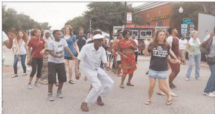
Hartsvillians celebrate in the streets their All-America City status on Friday night.

In celebration of the city of Hartsville's All-America City recognition, a downtown Block Party was held Friday evening with free hot dogs and drinks and T-shirts to the first 100 residents.