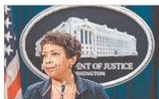
Attorney General Loretta Lynch said the Justice Department was left no choice but to sue Ferguson, Mo.