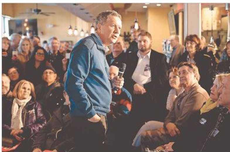
Ohio Gov. John Kasich, who claimed second place behind Donald Trump in the New Hampshire primary Tuesday, speaks Wednesday to a capacity crowd at Finn's pizza in Mount Pleasant.

With Trump soaring and Cruz confident, lower-tier Republicans compete to stay in race by courting state's undecided voters