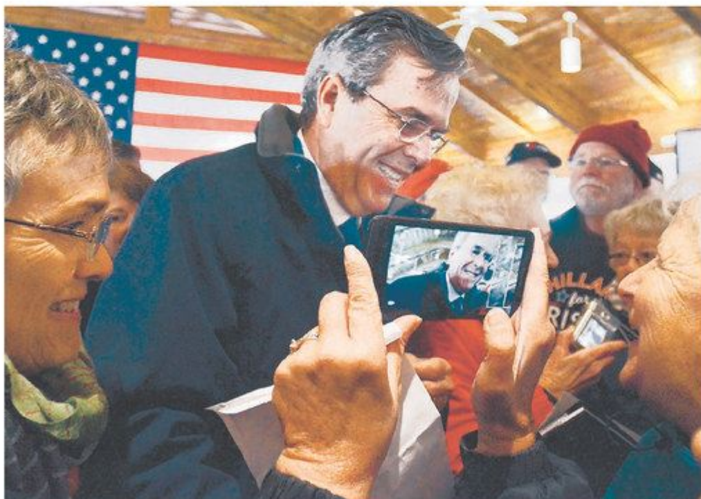
Republican presidential candidate Jeb Bush makes his way through the crowd Wednesday after his appearance at Sun City Hilton Head.