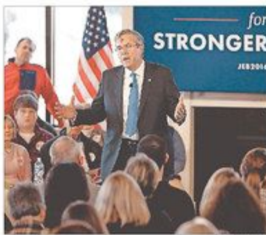
Former Florida Gov. Jeb Bush, with a smear of ash on his forehead in observance of Ash Wednesday, kicked off the South Carolina leg of his campaign Wednesday, including this stop at Mount Pleasant's Memorial Waterfront Park.

Appearing at Ground Zero, a Christian teen club near the Myrtle Beach boardwalk, Cruz went after Trump in his only appearance in the state Wednesday, describing