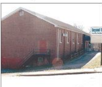
Beyond the Walls Family Restoration Center has applied for possible capital project sales tax funds to renovate the Seaboard Avenue Recreation Center building and swimming pool.

The town of Ninety Six also submitted various projects to replace water