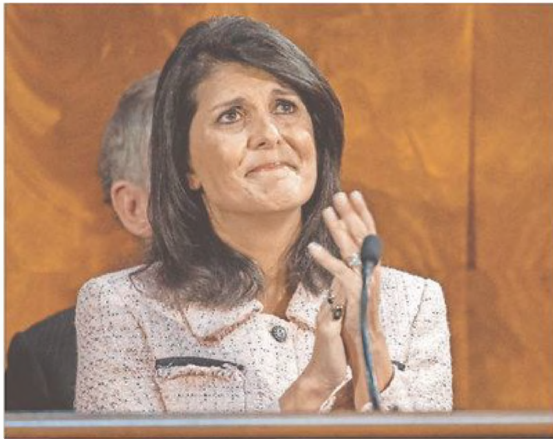
Gov. Nikki Haley holds back tears at the Statehouse in Columbia on Wednesday while delivering the State of the State address. Haley asked legislators to be inspired by victims and survivors of last year's tragedies to make South Carolina stronger.

With Emanuel survivors in audience, tearful Haley calls for unity while promoting domestic violence reform, education, roads agenda