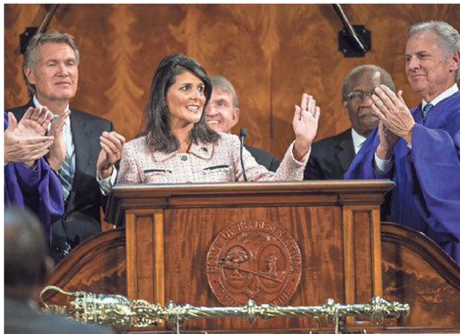
South Carolina Gov. Nikki Haley delivers the State of the State in the House chambers at the South Carolina Statehouse on Wednesday.