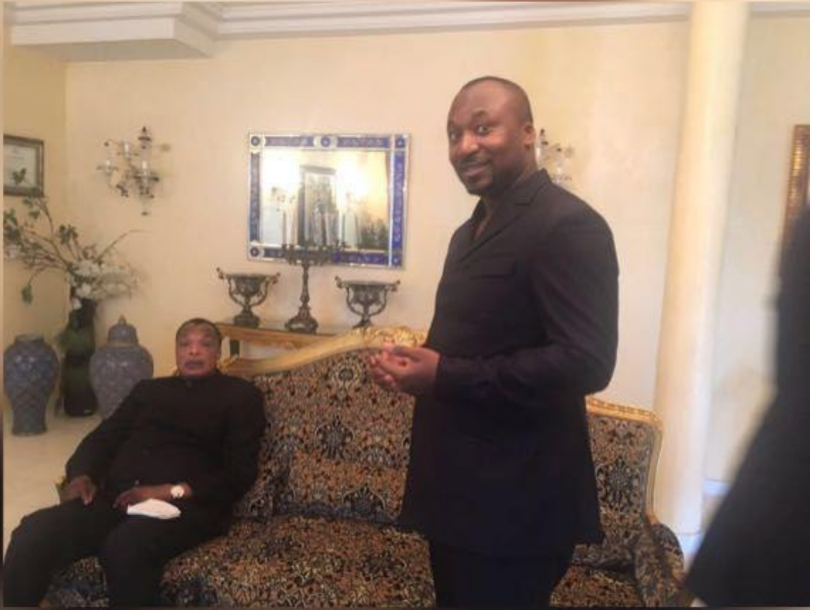
old Congolese dictator Denis Sassou Nguesso and his son Denis Christel Sassou Nguesso