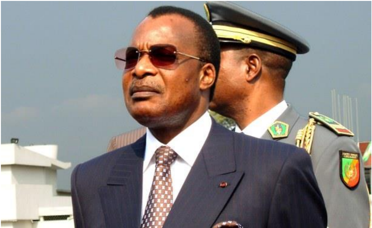
The godfather of the Congolese mafia