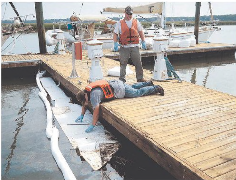
Workers with Moran Environmental Recovery use absorbent material to soak up oil at Lady's Island Marina on Thursday.

“I'M ALWAYS SO FASCINATED BY THEM. ... THEN SOMETHING TRAGIC LIKE THIS HAPPENS. MY HEART IS