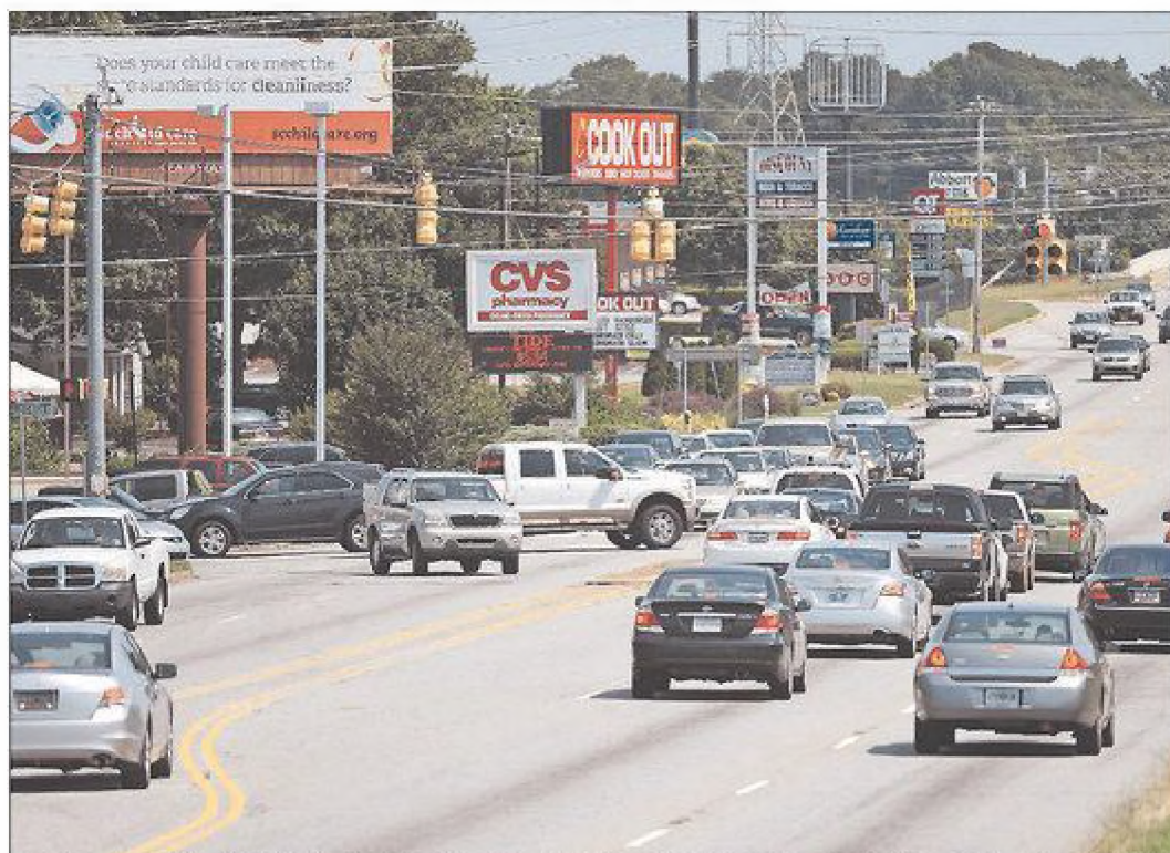
Traffic slows along Highway 9 in Boiling Springs at the intersection of Shoally Creek Road. The state Department of Transportation is looking at widening Highway 9 from Interstate 25 to Shoally Creek Road.