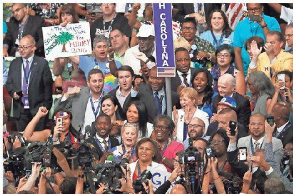
South Carolina delegates cast their nominating votes for President of the United States during the second day of the Democratic National Convention in Philadelphia on Tuesday. The delegation has been energized by young adults who got involved in the primary campaigns.