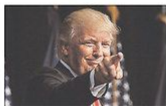
Republican presidential candidate Donald Trump points to the crowd after speaking during a campaign rally Wednesday at Lackawanna College in Scranton, Pa.

Wednesday night's Democratic lineup was aimed at emphasizing Clinton's own national security credentials. It was a