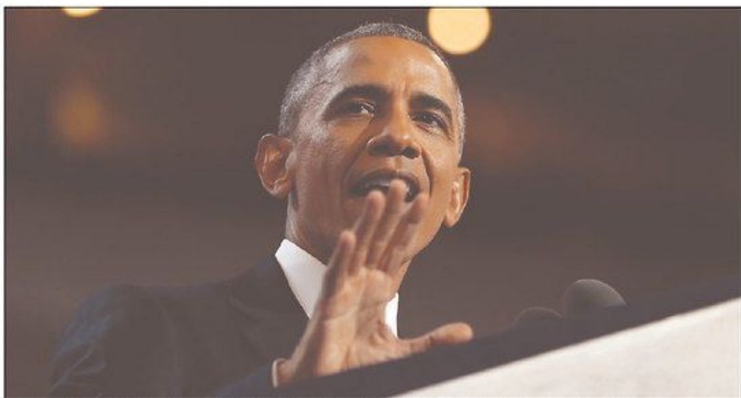
President Barack Obama speaks at the Democratic National Convention Wednesday in Philadelphia.