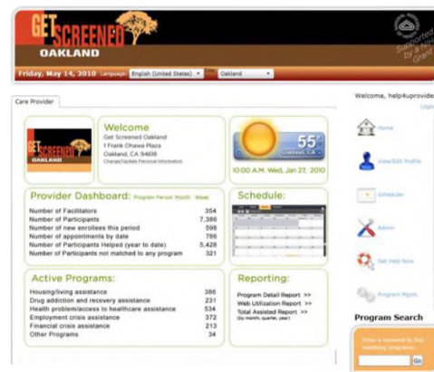
Get Screened Oakland