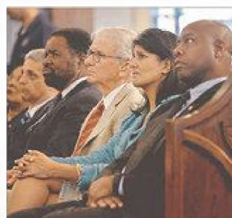
Charleston Mayor Joe Riley, Gov. Nikki Haley and U.S. Sen. Tim Scott attend a prayer vigil held at Morris Brown AME Church on Thursday.