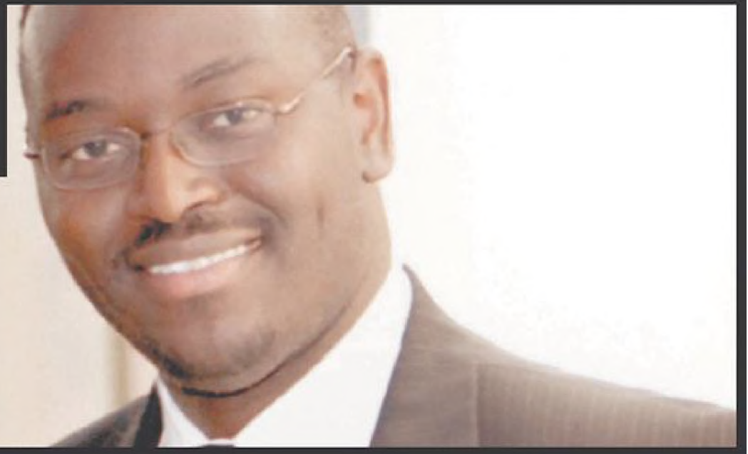
The (Columbia) Star