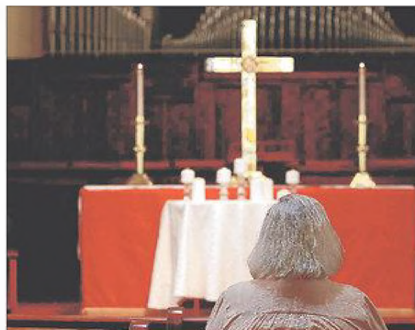
TOP: Religious leaders raise their hands in prayer Thursday inside Wesley UMC in Hartsville, surrounded by a crowd mourning the shooting at a Charleston church Wednesday that left nine people dead. BOTTOM: A person attending a prayer vigil at Hartsville's Wesley UMC on Thursday sits in silence before the church's altar.