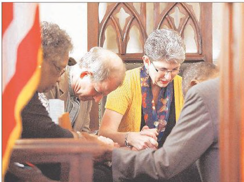
Religious leaders gather for prayer Thursday at Wesley UMC in Hartselle before the beginning of a vigil held in memory of the nine people shot and killed at a Charleston church Wednesday night.

Now we have this church shooting, which took the life of the pastor, who was a state senator, plus two other men and six women.