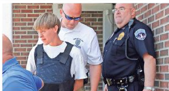
Shooting suspect Dylann Storm Roof leaves the Shelby Police Department on Thursday.