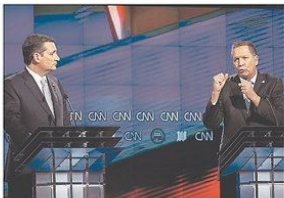
Republican presidential hopefuls, Ohio Gov. John Kasich, right, and Sen. Ted Cruz, left, debate March 10 in Coral Gables, Fla.