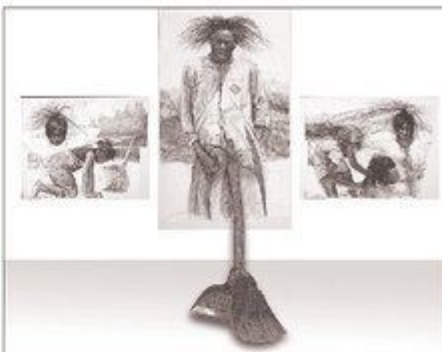
Charcoal drawings titled "Mother Nature's Last In-House Domestic Servant."

» From: Elgin, South Carolina » Age: 71 » How many years working as an artist? About 30 or 40 years. » Has he submitted to ArtFields previously? He was a juror last year and competed the previous year. » Favorite artistic medium to work in: Charcoal, pastels, oils.