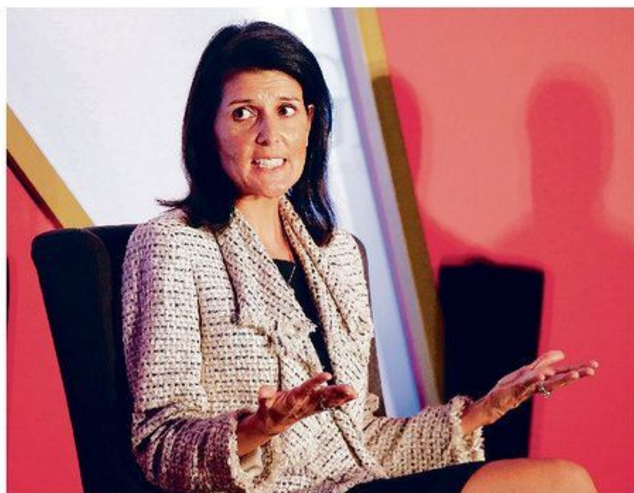
Gov. Nikki Haley speaks Tuesday at the Republican Governors Association annual conference in Orlando, Fla. Members of President-elect Donald Trump's transition team have discussed Haley as a potential secretary of state.