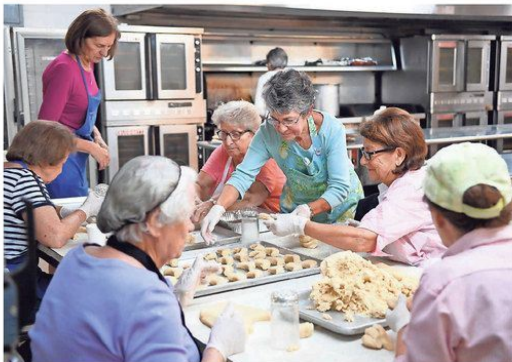
St. George Greek Orthodox Church members bake pastries on Wednesday in preparation for the Greek pastry and cookie bake sale.

SOME AMERICANS ARE TAKING A POST-ELECTION BREAK FROM FACEBOOK PAGE 1B