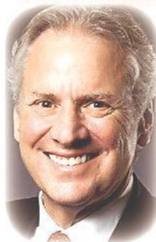
LT. GOV. HENRY McMASTER future US attorney general?