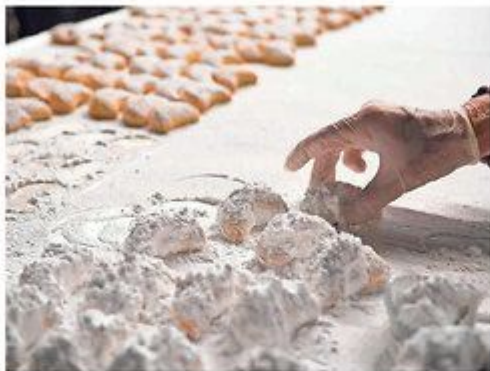
Philoptochos, the women's philanthropic arm of St. George, uses money it raises from the sale to help the poor, children and the community.

In 50 years, the sale has become part of the church's lifeblood for the church, part philanthropy and part cultural history. The sale is put on each year by Philoptochos, the women's philanthropic arm of St. George, and it is the