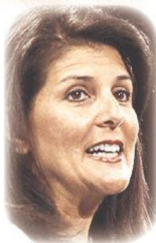
GOV. NIKKI HALEY future secretary of state?

IT'S YOUR TURN: Do you think S.C. Gov. Nikki Haley would make a good secretary of state? Take our Twitter poll @ijindexjournal or weigh in on our Facebook page.