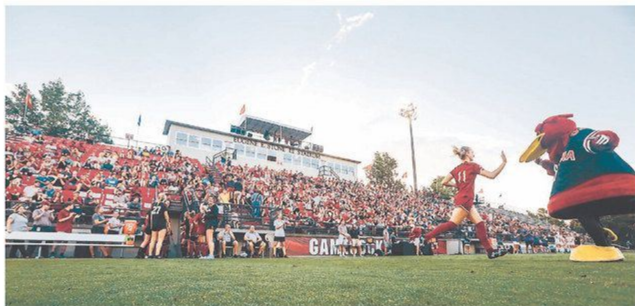
Stone Stadium will host three soccer matches Thursday.