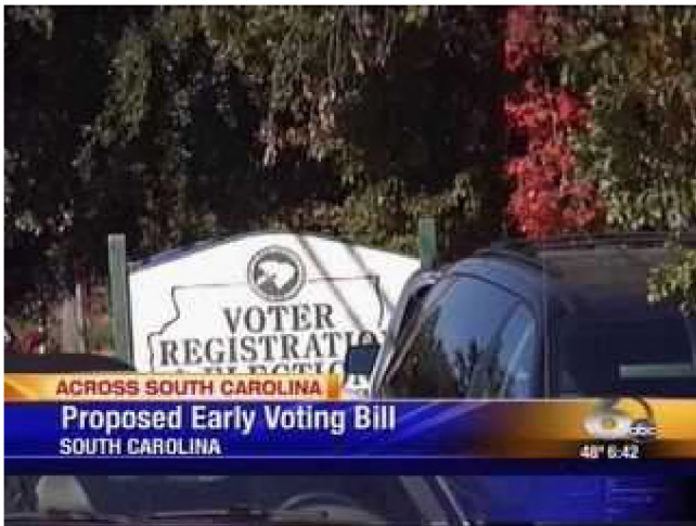
WJBF (ABC)2/6/2013 6:41:48 AM Augusta, GA Good Morning Augusta

filibuster.all five senators are against hagel's nomination but disagree with blocking it by a filibuster. governor nikki haley is making a stop in the upstate today. today.at 3:15 she'll tour "sage automotive interiors" on highway 72 west in abbeville. we're not exactly sure what she'll talk about, but make sure to watch thee news tonight for a recap of her visit. 3 on tuesday, a lot of you may have stuffed your face with pancakes for national pancake day--no worries, today we have a workout program that promises you can lose weight in 90 days-