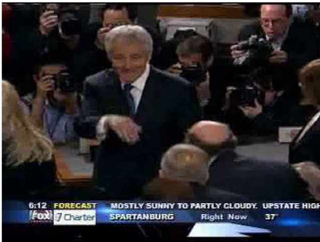
Greenville, SC Morning News @ 6