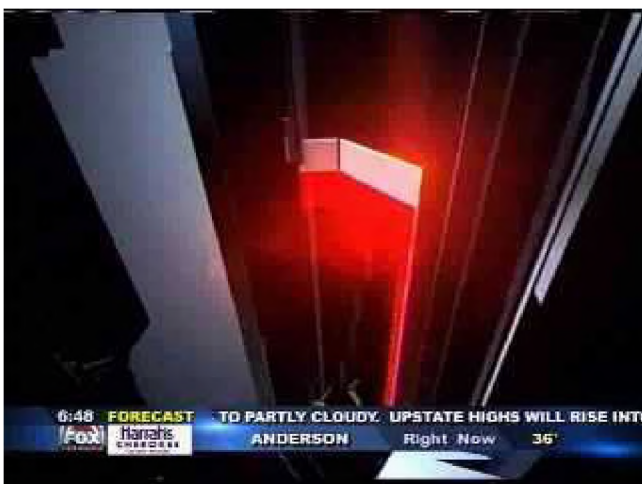
WHNS (FOX)2/6/2013 6:48:26 AM Greenville, SC Morning News @ 6

because of concerns about it. right now, 34 states, and the district of columbia already have early voting... including georgia and north carolina. gov. nikki haley is expected to visit mccormick and abbeville today. at noon she will hold "constituent office hours" at the mccormick town hall. and at 3:15, the governor is set to tour sage automotive interiors in abbeville. aiken county's board of education could impact the way project jackson is funded. the city is now looking at creating more tax increment financing - or tif - districts in order to keep taxpayers from footing most of the bill. this would allow