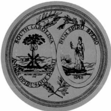
MARK SANFORD Governor

A handwritten signature of Mark Sanford in black ink.