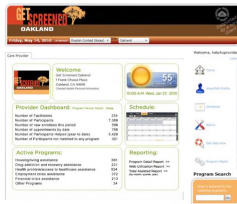
Get Screened Oakland