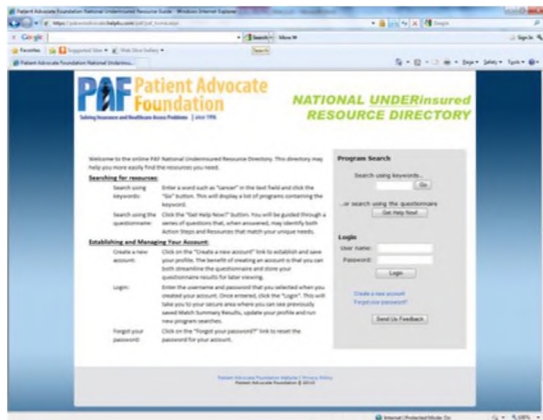
Patient Advocate Foundation

Here are a few examples of how the Powered by Help4U® platform has been used for specific agencies and applications: