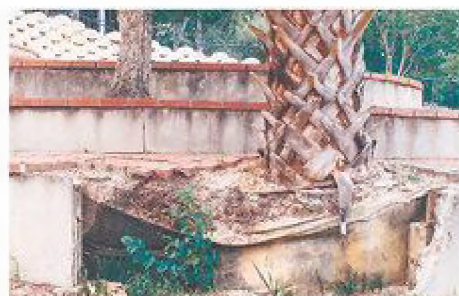
Erosion and disrepair plague Finlay Park as shown in this image of a tree in a terraced area.

Benjamin said last week that he's working on a proposal to create a small taxing district that would capture property taxes on buildings along Assembly Street stretching north to Laurel Street, west to just behind the rundown park and south to Washington Street.