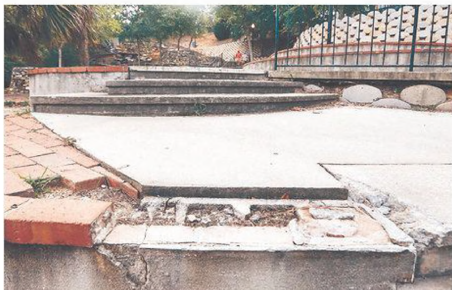
Visitors to Finlay Park encounter disrepair like this.