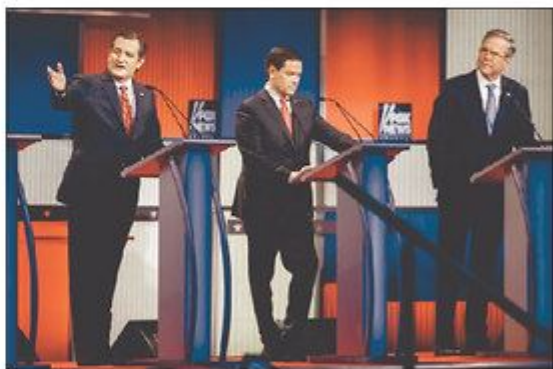
Republican presidential candidate Sen. Ted Cruz, R-Texas, left, answers a question as Sen. Marco Rubio, R-Fla., center, listens and former Florida Gov. Jeb Bush, right, looks on during Thursday's Republican presidential primary debate in Des Moines, Iowa.