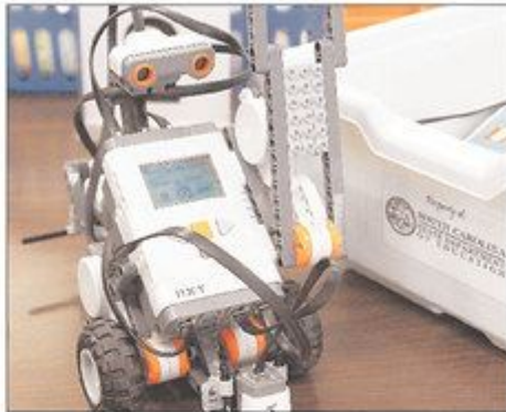
Students from Carolina Elementary and the Governor's School for Science and Mathematics worked together during a six-day after-school program recently to learn about and build robots like this one.

For more information, visit www.darlington.k12.sc.us and www.scgssm.org .