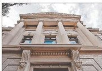
The Gibbes Museum is undergoing renovations, including improvements to protect the art collection.

That’s when everyone can see a building both restored to its original 1905 Beaux Arts luster as well as updated with improved public spaces for working artists, classrooms, meetings and other events.