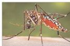
The Aedes aegypti mosquito is a vector for the proliferation of the Zika virus.

To date, no Zika virus cases have been identified in South Carolina. Please see ZIKA , Page A6