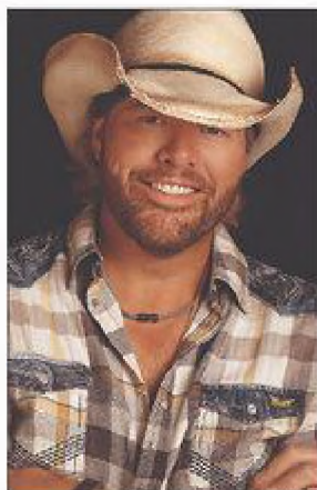
Toby Keith will play his first concert at the Florence Civic Center in September.