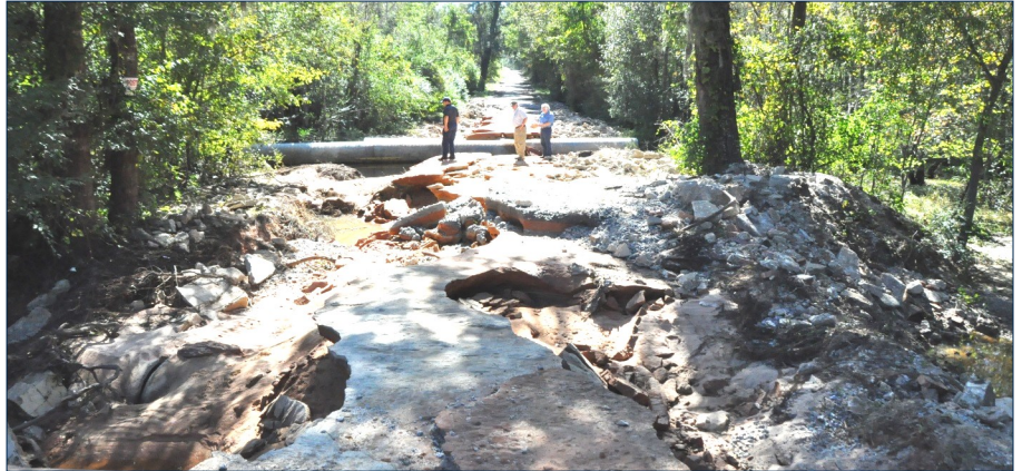
SCEMD recovery specialists conduct a site visit in Florence County to inspect damage caused by Hurricane Matthew.

SCEMD continues coordination with all disaster recovery partners in support of local recovery efforts for residents, local governments and private organizations to ensure that all recovery aid is available to everyone who is eligible throughout the state. The SCEMD Recovery Section began operations well before Hurricane Matthew's landfall by coordinating the disaster declaration process and providing necessary documentation to all counties statewide. SCEMD's private sector group processed more than 1,000 business requests for post-disaster reentry and provided daily updates to over 1100 commercial entities throughout the activation, response, and initial stages of recovery. Immediately following the storm, SCEMD deployed six damage assessment teams to survey the entire state and assist county emergency managers in determining eligibility for federal disaster recovery programs.