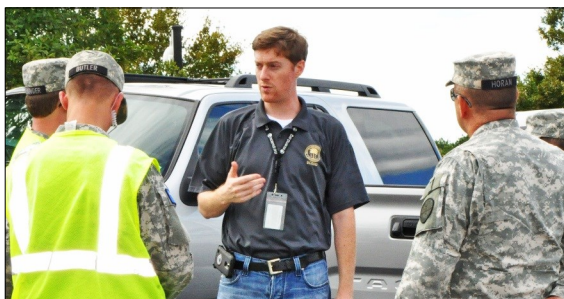
SCEMD Operations Support works with partner agencies to supply resources and maintain emergency operations facilities.