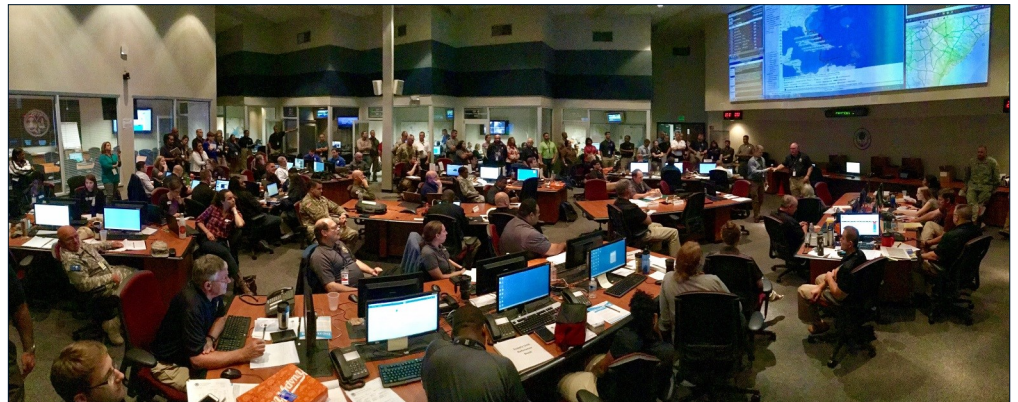
South Carolina's State Emergency Operations Center fully activated by all agencies during the response to Hurricane Matthew.

Coordination efforts during this time included twice-daily conference calls with all of the state's county emergency managers and state emergency support function staff. As the storm approached a point where large evacuation support functions were necessary, twice-daily conference calls with the Governor and select agency heads comprising the executive group were also conducted. As the storm arrived, FEMA headquarters conducted video teleconferences daily, and after the storm passed, U.S. Congressional conference calls were conducted daily.