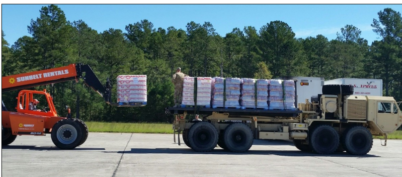
Relief supplies being loaded onto a National Guard vehicle at the SCEMD staging area in North, S.C.