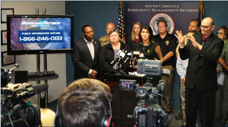
Governor Nikki Haley and agency leaders conducted ten emergency news conferences from the state Emergency Operations Center.

During the approach of Hurricane Matthew and in its aftermath, the state's emergency public information team maintained continuous engagement with residents through all multimedia resources available. In coordination with the Adjutant General's Office, the Governor's Office, the Federal Emergency Management Agency, and local governments, state public information officers coordinated media availabilities, published more than 66 media advisories, news releases and fact sheets to date.