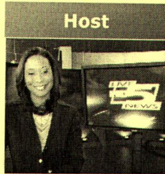
Host Aisha Tyler Live 5 News