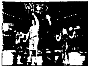
Ted Cruz and family at Liberty University as he announces his run for President of the United States of America.