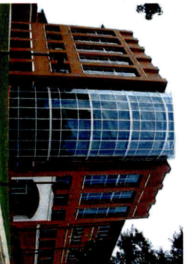
Library/Computer Science-Engineering Building to complement Hodge Hall