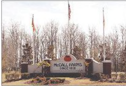
McCall Farms is expected to invest $23 million by 2020.

Four-year plan to create hundreds of new jobs