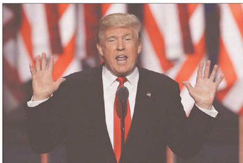
Republican Presidential Candidate Donald Trump speaks during the final day of the Republican National Convention in Cleveland on Thursday.