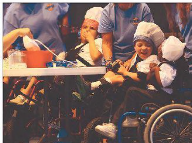
ABOVE: Camper at the 4th annual "Camp RAE's Got Talent" whip up some desserts for the judges.

Camp RAE campers open the night at the 4th Annual "Camp RAE's Got Talent."