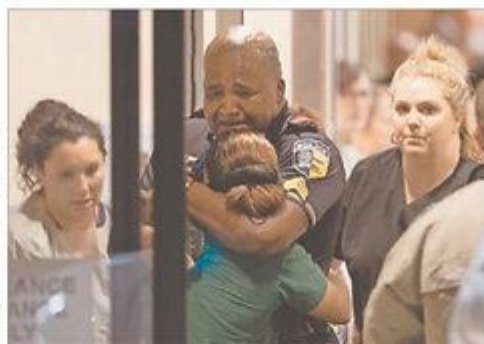
A Dallas Area Rapid Transit police officer receives comfort at the Baylor University Hospital emergency room entrance Thursday night in Dallas.