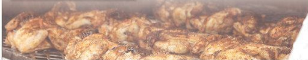
The smell of barbecue and the sound blues music filled the air in Uptown Thursday for the Festival of Discovery and Greenwood Blues Crusie. For more photos and video, visit indexjournal.com .