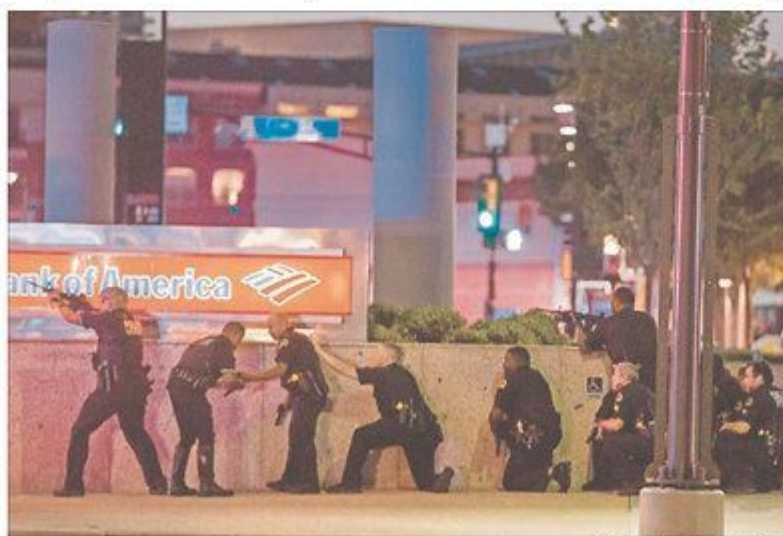
Dallas police officers respond after shots were fired at a Black Lives Matter rally in downtown Dallas on Thursday.

Snipers kill at least 4 police officers, wound 7 during rally