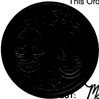
MARK SANEORD Governor

GIVEN UNDER MY HAND AND THE GREAT SEAL OF THE STATE OF SOUTH CAROLINA, THIS 24 th DAY OF JANUARY 2005.