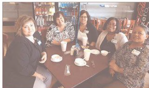
McLeod Health Cheraw celebrates a successful first year.