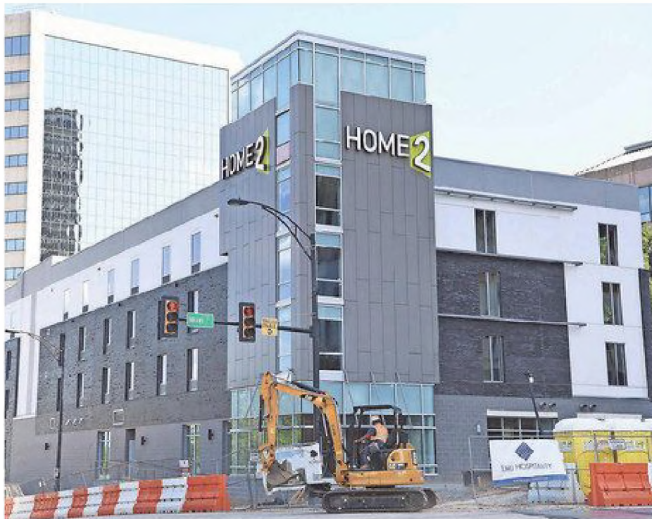
Construction continues on the new Home 2 hotel on North Main Street downtown.

SANDERS VOWS HIS FULL SUPPORT TO BACK CLINTON'S ELECTION PAGE 1B