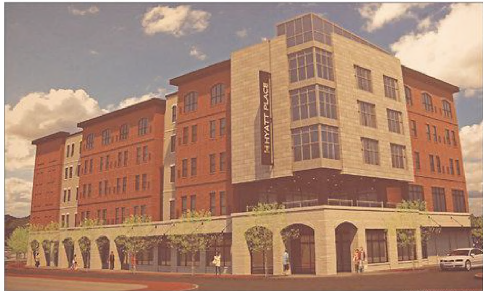
An artist's rendering shows a new Hyatt Place hotel planned for downtown Florence, which was officially unveiled Tuesday morning by Raines Hospitality and SpringBridge Development.