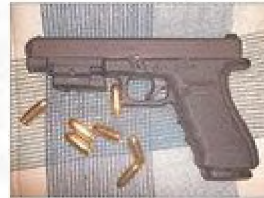
A photo on an alleged manifesto website created by Dylann Roof shows the .45-caliber Glock pistol he's accused of using in a deadly June 17 attack at Emanuel AME Church.