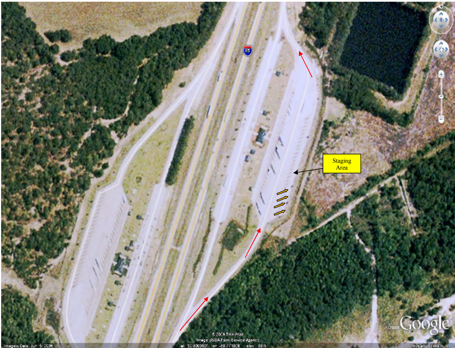
Tab -B Regional Staging Areas