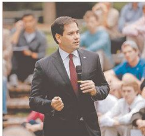
Republican presidential candidate Marco Rubio appears Tuesday at the College of Charleston as part of the "Bully Pulpit" series.