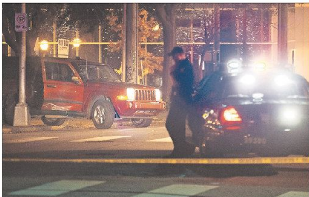
A car involved in an officer-involved shooting that left an 18-year-old Greer man dead sits on the sidewalk as a police officer stands by in downtown Atlanta on Monday night.