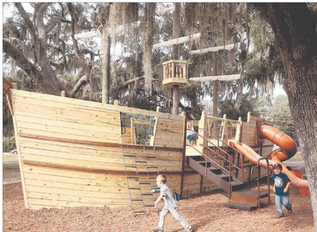
Children play at the new playground in Naval Heritage Park on Tuesday afternoon in Port Royal.