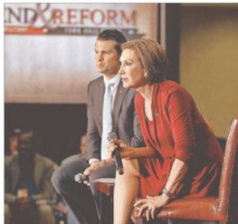
Republican presidential candidate Carly Fiorina spoke at a Concerned Veterans for America town hall event at The Citadel's Holiday Alumni Center on Tuesday.